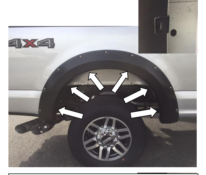
STEP 11: Place the Fender Flare onto the vehicle and fit into the correct position following the contours of the body. Use six (6) provided "U" Shaped Retention Clips to secure the Fender Flare to the body. Ensure the barb in the clip securely attaches in the slot on the Fender Flare. REPEAT ALL ABOVE STEPS FOR OPPOSITE SIDE OF VEHICLE.