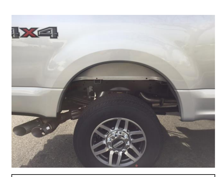
STEP 10: Clean the body areas where the Fender Flares will makes contact. A light misting on fender using a soap and water solution can aid in proper rubber placement.

Pocket Look Fender Flares Ford Super Duty (17-On) FF1018