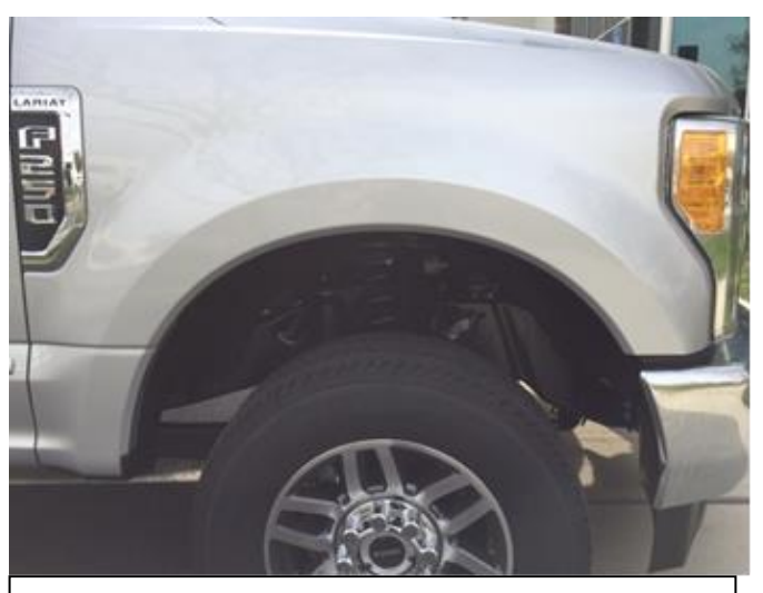
STEP 4: Clean the body areas where the Fender Flares will makes contact. A light misting on fender using a soap and water solution can aid in proper rubber placement.