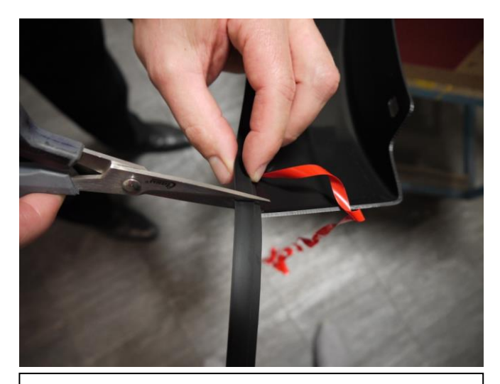
STEP 3: Trim any unnecessary extrusion and discard.

Pocket Look Fender Flares Ford Super Duty (17-On) FF1018