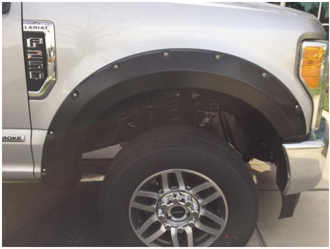
STEP 6: Place the Fender Flare onto the vehicle and fit into the correct position following the contours of the body. Ensure the slots in the part align with the holes in the fender from the previously removed 7/32" socket head screws.