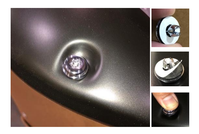
STEP 1: Attach the extruded plastic bolts. Peel back white tape liner from the bottom side of the extruded plastic bolt and press until it snaps into place. Ensure inside of Fender Flares where the rubber seal is attached is clean, using the alcohol wipes provided. Wipe away any residue with a dry clean cloth.