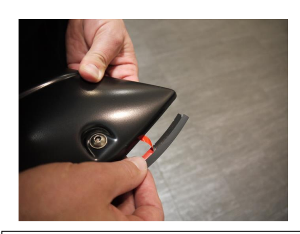
STEP 2: Attach the included rubber seal to the Fender Flares. Peel back 2" of the adhesive backing and position on the Fender Flare. Attach the double sided tape to the inside of the Fender Flare, peeling back a few inches at a time. Ensure pressure is used to secure rubber seal to Fender Flare edge. Attach rubber seal along all areas the Fender Flare will make contact with the vehicle body.