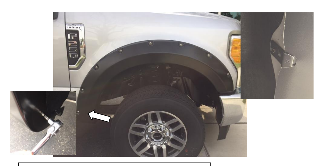
STEP 7: Loosely reinstall the lowest rear 7/32" socket head screws through slot in the Fender Flare to the vehicle. Make sure the screws are securely engaged to the vehicle fender. Install provided Long Attachment Clips in remaining four (4) Fender Flare Slots. Loosely reinstall remaining 7/32 in socket head screws. Ensure part is still in the position of best fit and extrusion is in correct position before hand tightening all screws.

Pocket Look Fender Flares Ford Super Duty (17-On) FF1018