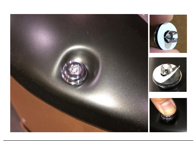
STEP 8: Attach the extruded plastic bolts. Peel back white tape liner from the bottom side of the extruded plastic bolt and press until it snaps into place. Ensure inside of Fender Flares where the rubber seal is attached is clean, using the alcohol wipes provided. Wipe away any residue with a dry clean cloth.