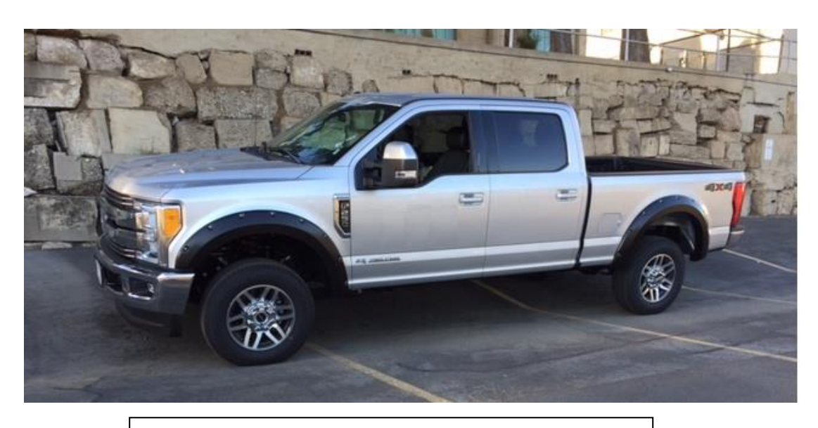
STEP 12: Double check the front and rear Fender Flares to make sure all bolts are tight and clips are securely fastened. Your installation is now complete. Do not use abrasive cleaners.