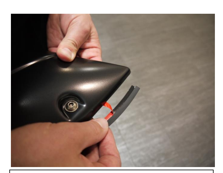
STEP 9: Attach the included rubber seal to the Fender Flares. Peel back 2" of the adhesive backing and position on the Fender Flare. Attach the double sided tape to the inside of the Fender Flare, peeling back a few inches at a time. Ensure pressure is used to secure rubber seal to Fender Flare edge. Attach rubber seal along all areas the Fender Flare will make contact with the vehicle body.